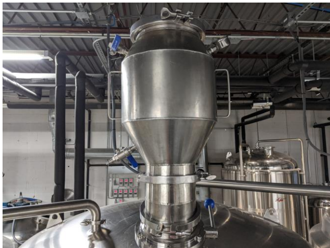
Figure 2. Dry hop doser.

A dry hop doser (Fig. 2) mounts to either a 4 or 6 inch valve attached to the dry hop port on the top of your tank. The hop doser is big enough to hold either 11 or 22 pounds of hops and is equipped with hardware to purge the doser and pellets with CO 2 before dropping them into the beer. At Sapwood, we keep the valve to the tank closed, open the dry hop doser from the top, and pour in the hops. After clamping the doser shut, we run CO 2 through the doser for a few minutes (allowing the CO 2 to exit as it enters), then purge it by bringing the doser up to 15 PSI and blowing it down to 0 PSI, and repeat 10 times. After bringing the doser up to the same head pressure as the tank, we can then open the valve attached to the dry hop port, dropping the hops in without opening up the tank. As a bonus, when dry hopping with a hop doser, we do not have to worry about a hop-